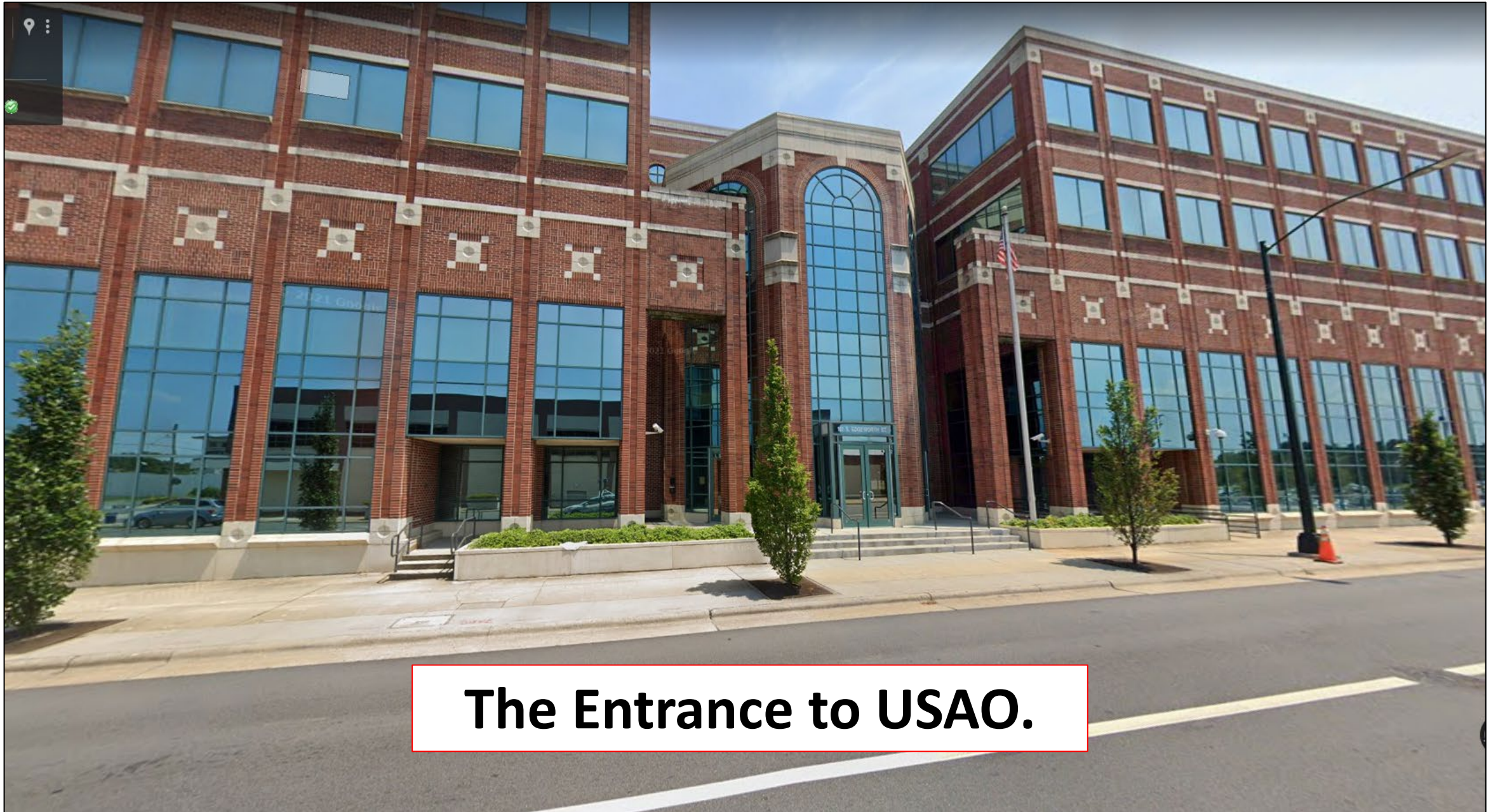
The Entrance to USAO.